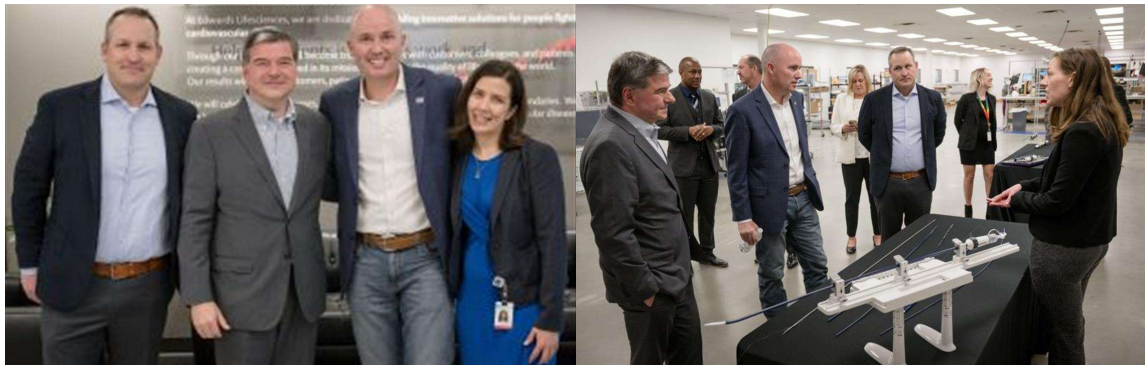
Gov. Cox visited the Draper campus on April 26. He toured the facility and sat down for a roundtable discussion with employees.