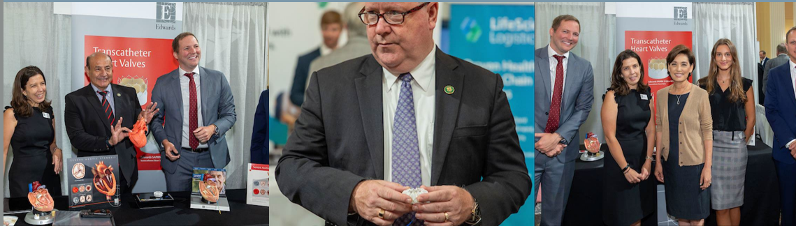
Pictured from left to right: GA Team with Rep. Lou Correa (D-CA), Rep. Larry Buschon (R-IN), GA Team with Rep. Young Kim (R-CA) at the HCL Innovation Exposition

On July 12, the Healthcare Leadership Council hosted an Innovation Exposition on Capitol Hill, providing an opportunity for Members of Congress to interact with healthcare companies and showcase the lifesaving products being advanced by the industry. Edwards' exhibit highlighted our work on transcatheter therapies, including TAVR and a transcatheter tricuspid valve therapy for patients experiencing tricuspid regurgitation, a debilitating disease with no current FDA-approved treatment.